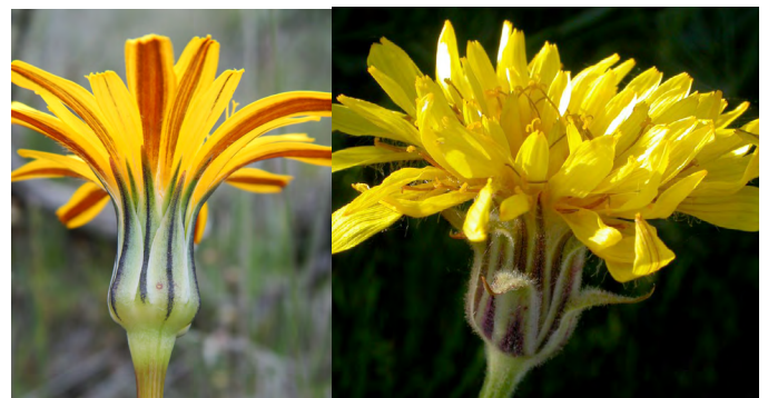
Figure 2. Sagebrush false dandelion flower heads with involucre bracts and ligulate ray florets.

Inflorescences (Fig. 2) are erect heads of 13 to 90 ligulate ray florets borne singly on each peduncle (Chambers 1993). Flower heads are each subtended by an involucre 0.6 to 1 inch (15-25 mm) wide consisting of 8 to 25 subequal, linear to lanceolate bracts (phyllaries) with the outer series shorter than or equal to the inner (Chambers 1993). The bracts are acuminate at the tip, green, sometimes with purple dots, and glabrous to white-hairy, especially on the margins and midrib, which is often purple (Cronquist 1955; Chambers 1993, 2006). The florets exceed the bracts. Ligules are yellow, sometimes with an orange midrib that may become pinkish with age. Florets may close early in the day during hot weather (Taylor 1992; Chambers 1993).