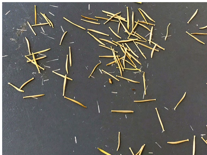
Figure 6. Sagebrush false dandelion seed after initial cleaning (above) and seed following final cleaning (below) at the USFS Bend Seed Extractory.

Wildland Seed Yield and Quality. The cleanout ratio (clean seed weight:rough weight of seed collection) for seed lots of sagebrush false dandelion cleaned at the USFS Bend Seed Extractory and seed quality data for these lots