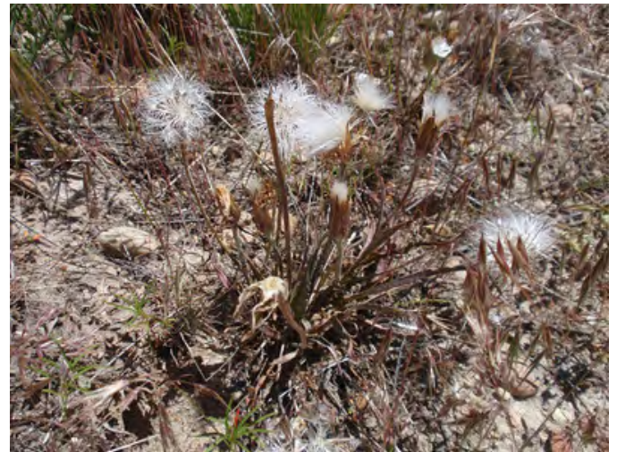
Figure 4. Sagebrush false dandelion plants with mature and dispersing seedheads illustrating uneven ripening.

Wildland seed certification. Wildland seed collected for direct sale or for establishment of agricultural seed production fields should be Source Identified through the Association of Official Seed Certifying Agencies (AOSCA) Pre-Variety Germplasm Program that verifies and tracks seed origin (Young et al. 2003; UCIA 2015). For seed that will be sold directly, collectors must apply for certification prior to making collections. Applications and site inspections are handled by the state where collections will be made. For seed that will be used for agricultural seed fields, nursery propagation or research, the same procedure must be followed. Seed collected by some public and private agencies