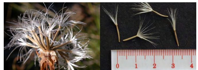
Figure 5. Mature fruits (cypselas, false achenes) of sagebrush false dandelion with pappus bristles. Note the lack of beaks on the fruits.

Post-collection management. Molding can occur if leaves and stems, which contain milky juice, are collected along with the seeds, particularly if collected during high humidity periods. Vegetative material should be removed promptly by hand or with sieves. Harvested seed should be spread on racks in a protected area and thoroughly air dried in the field or following transport to the cleaning facility. Collected material can be transported in clean, breathable bags or boxes and should be protected from overheating during transport. Insect infestations should be controlled by freezing collections for 48 hours or use of appropriate chemicals.