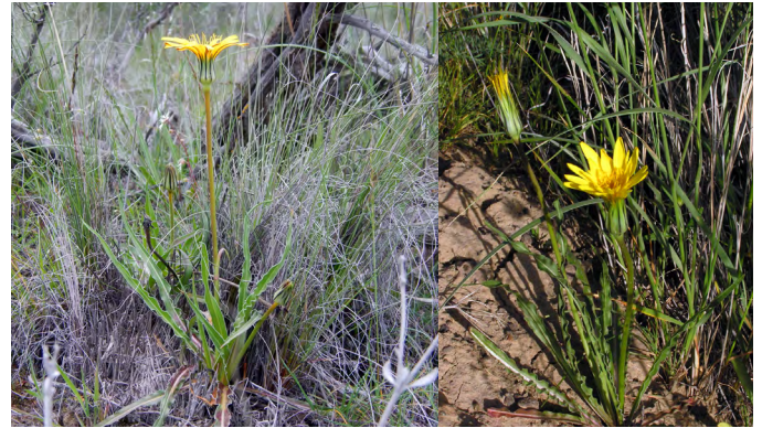
Figure 1. Sagebrush false dandelion plants in flower.

inches (5 to 15 cm) long and less than 0.4 inches (1 cm) wide (Cronquist 1955; Munz and Keck 1973; Taylor 1992). Leaf surfaces are glabrous or villous, and the margins are often wavy and ciliolate (Cronquist 1955; Chambers 2006).